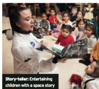
Story-teller: Entertaining children with a space story

Let children's dreams come true on your wedding with the help of Mini Maniacs . With everything from charismatic storytellers to colourful characters, children's entertainers are sure to go down a storm. The specialists can organise premium entertainers to keep kids busy while the adults mingle and hit the dance floor. Whether it's an impersonator, story-teller or magician, they'll work and set up in any designated space. Keeping things fun and interactive, their team designs, styles and organises kid-friendly-fun to help you create your lifelong memories.