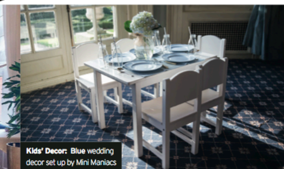
Kids' Decor: Blue wedding decor set up by Mini Maniacs